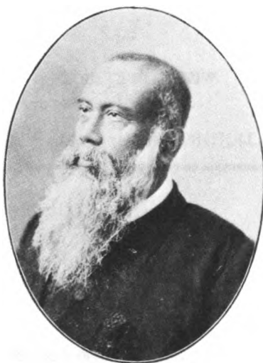
DR. BRAJENDRANATH SEAL (1864— )